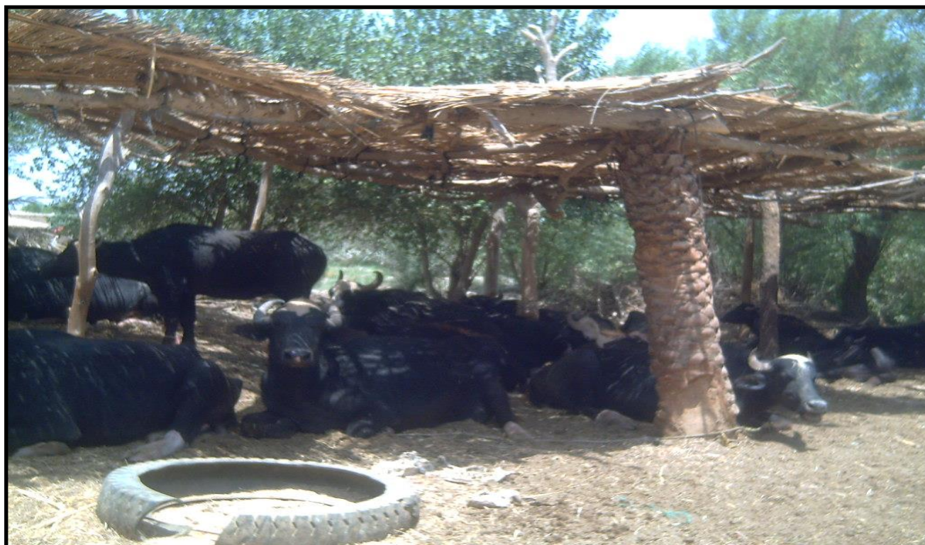
Photo 1. Iraqi buffalo fed on cottonseed-supplemented diet in Thi-Qar governorate