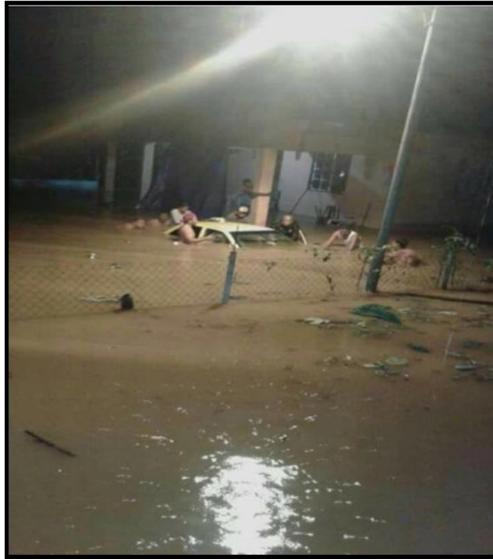
Community of Upala, Alajuela, Costa Rica after the pass of Hurricane Otto, early morning of November 25 th , 2016