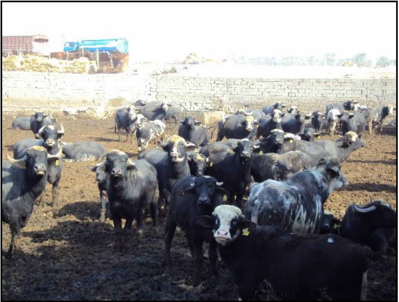
Photo 3. Iraqi buffalo fed on cottonseed-supplemented diet in Baghdad governorate