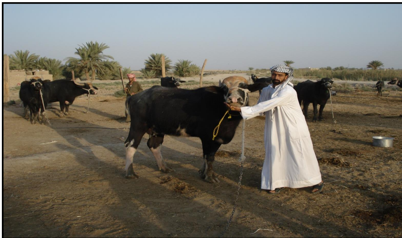
Photo 2. Iraqi buffalo fed on cottonseed-supplemented diet in Muthanna governorate