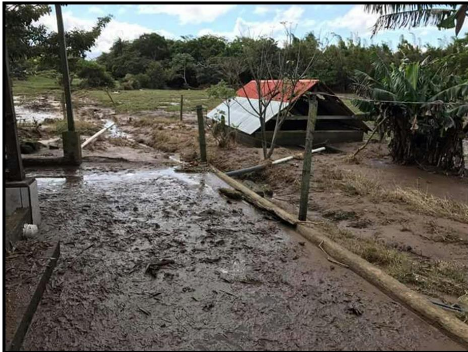
Dairy farm destroyed after the pass of the Hurricane Otto on November 26 th , 2016