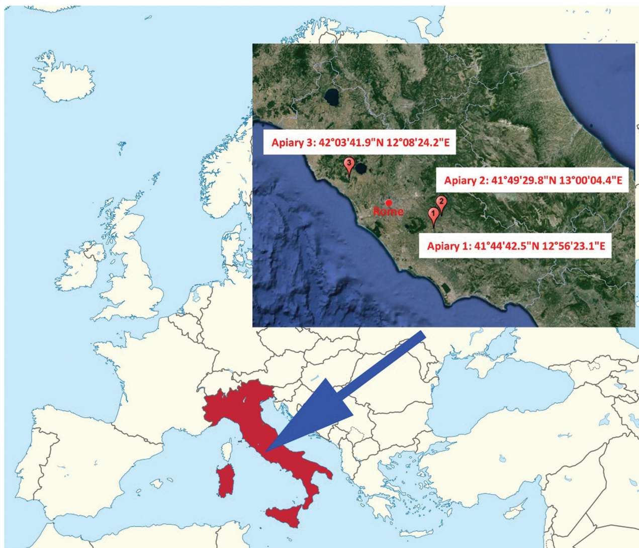
Figure 1. Apiary locations for field trials 2014 (markers 1 and 2) and 2015 (marker 3).

We used 290 ml of formic acid 60% and the larger U-wick size, according to label instructions for Dadant-Blatt beehives.